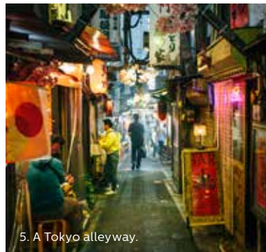
5. A Tokyo alleyway.