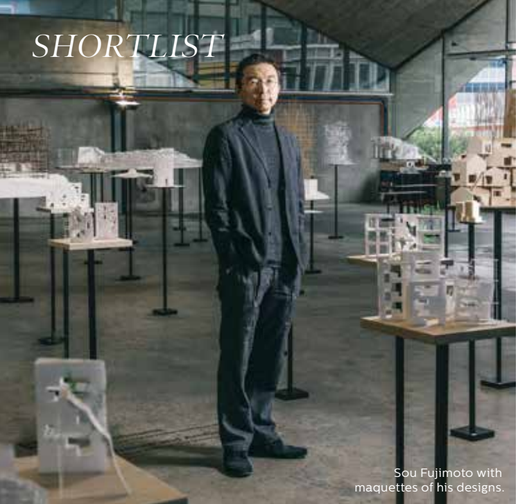
Sou Fujimoto with maquettes of his designs.