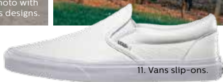
11. Vans slip-ons.