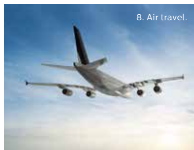
8. Air travel.