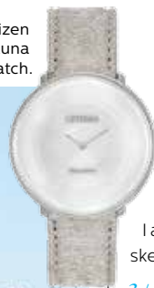
9. Citizen Ambiluna watch.