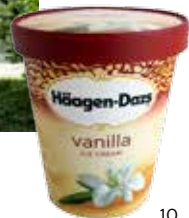
10. Vanilla ice cream.