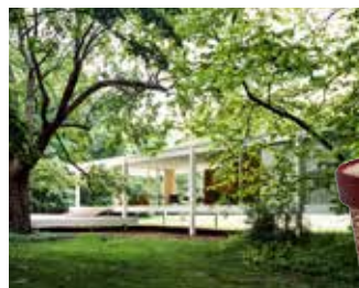
1. The Farnsworth House in Plano, Illinois.

I'll have three or four cups of black coffee throughout the day. I don't drink the entire cup each time—just enough to get the flavor and essence of it.