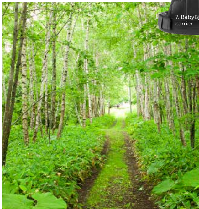
3. A forest in Hokkaido, Japan.