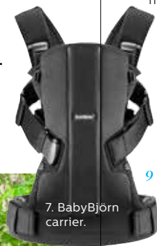
7. BabyBjörn carrier.

PHOTOGRAPHY: JERRY TRIPLETON/ANZENBERGER/REDUX. PORTRAIT: NICOLAS SCHOPFER. 1, 3, 4, 5, 8: GETTY IMAGES; 12: JARRY-TRIPLETON/ANZENBERGER/REDUX. FOR DETAILS, SEE RESOURCES